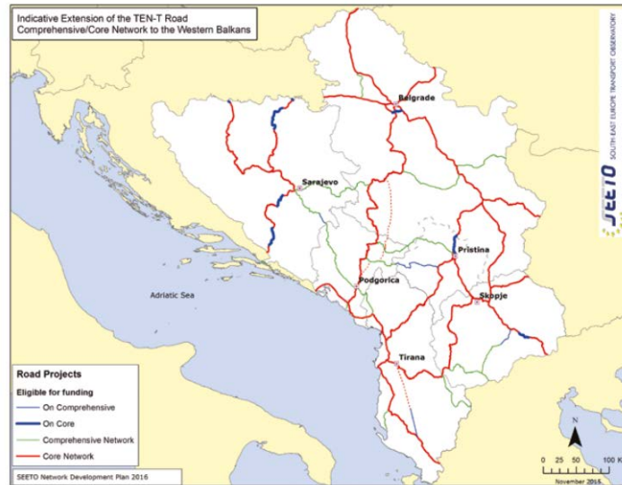
Fig.1. Regions on T-v Diagram

The software Trans Cad is used to carry out the road and transport corridors analysis in Balkans, and main roads in Kosovo (route 6 and 7), which provides the option of analysing O/D (ORIGIN-DESTINATION).