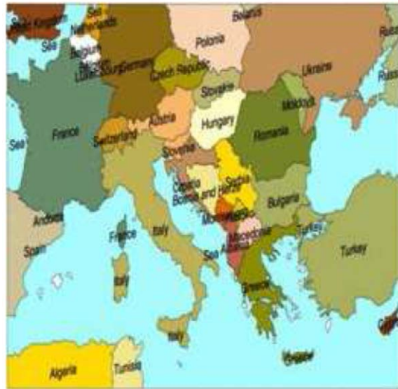
Fig.2. Map of study zoning – European States done with Trans Cad